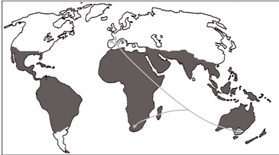
Figure 1. Gray area indicates world natural distribution map for the genus Acacia . Native areas comprise the Australia/Pacific region, South Asia, Africa and the Americas. Lined area indicates native distribution map for Acacia dealbata . As shown, the native range includes Tasmania, Victoria and New South Wales. Arrows show the new distribution area of A. dealbata from the native range.

A. dealbata was first introduced in Europe towards 1800 (Sheppard et al., 2006). It was planted as an ornamental in the 19th century in many areas of southern Europe, which offered favorable climates for its development, with sufficient sun exposure and little frosts. At present, it is widely naturalized in southwest Europe (Sheppard et al., 2006; Tutin et al., 2001) (Fig. 1). It occurs in riparian zones, water courses and sunny edges of pinewoods, or on south and westfacing slopes, where it forms dense stands that choke the natural vegetation. Acacia dealbata often invades areas under intensive agricultural use and further away from the sea than the other Acacia species present in these regions (Aguar et al., 2001). Acacia dealbata is a problem species in Portugal (Almeida and Freitas, 2006), northwest Spain, where it is threatening the native flora and becoming a serious environmental problem (Carballeira and Reigosa, 1999), and in France and Italy, where it is locally dominant in the Mediterranean littoral (Sheppard et al., 2006) (Fig. 1).